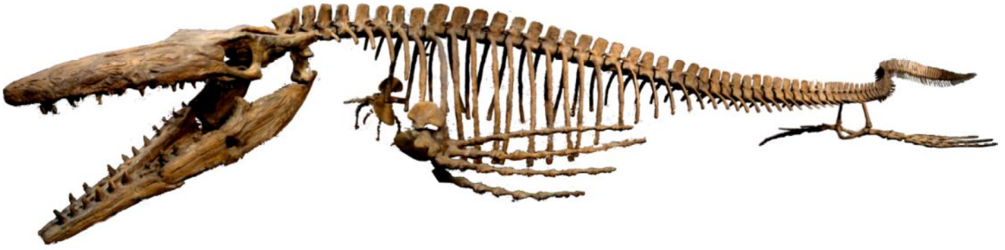
Bruce is one meter longer than a city bus!